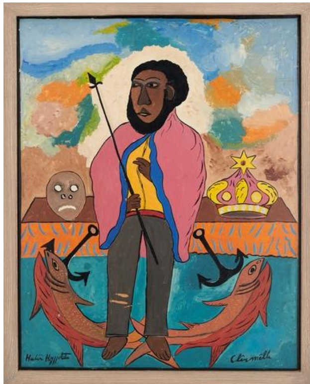
Remember the Rain Seattle Art Museum August 18, 2023–February 2024

A popular Haitian proverb says: “Remember the rain that makes your corn grow.” This expression of gratitude, remembrance, perseverance, and an understanding of the connectedness between heaven and earth resonates across the works in this gallery.