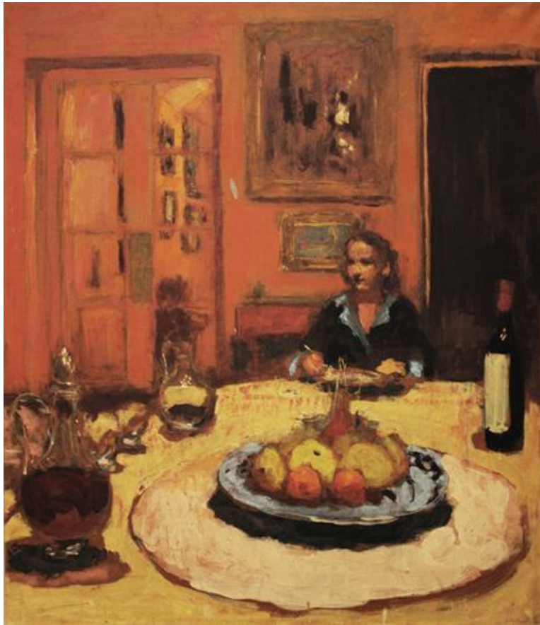
France: Inside and Out Seattle Art Museum Ongoing

This installation of landscapes, domestic interiors, and decorative arts from the museum's collection showcases stylistic developments in 19th-century French painting and design. It also invites us to think about the different worlds of men and women at that time.