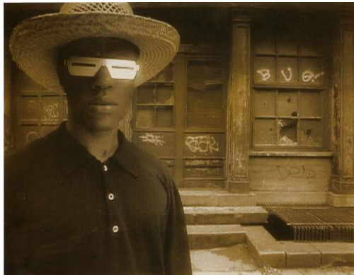
Video still from The Last Angel of History , 1995, Black Audio Film Collective, John Akomfrah, single channel color video, sound, 45 minutes 7 seconds, © Smoking Dogs Films; Courtesy Smoking Dogs Films and Lisson Gallery.