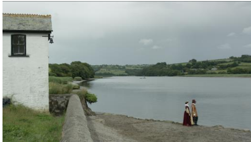
Video still from Tropikos , 2016, John Akomfrah, single channel color video, 5.1 sound, 36 minutes, 41 seconds, © Smoking Dogs Films; Courtesy Lisson Gallery.