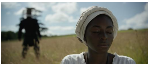
Video still from Tropikos , 2016, John Akomfrah, single channel color video, 5.1 sound, 36 minutes, 41 seconds, © Smoking Dogs Films; Courtesy Lisson Gallery.