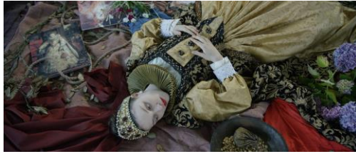
Video still from Tropikos , 2016, John Akomfrah, single channel color video, 5.1 sound, 36 minutes, 41 seconds