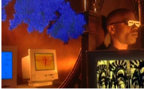
Video still from The Last Angel of History , 1995, Black Audio Film Collective, John Akomfrah, single channel color video, sound, 45 minutes 7 seconds, © Smoking Dogs Films; Courtesy Smoking Dogs Films and Lisson Gallery.