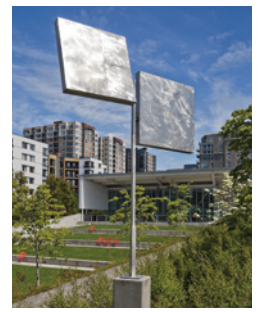
3 George Rickey Two Plane Vertical Horizontal Variation III , 1973

Rotating art installations enliven the PACCAR Pavilion and the 2,200-foot path that zigzags from the pavilion to the water's edge. Stop by the Information Desk to learn more about the artworks on view today.