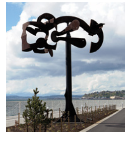
18 Mark di Suvero Schubert Sonata , 1992

One of the world's foremost sculptors, Plensa modeled Echo on the 9-year-old daughter of a restaurant owner near the artist's studio in Barcelona. The sculpture's title references Echo, the mountain nymph from Greek mythology, who offended the goddess Hera. To punish Echo, Hera deprived the nymph of speech, except for the ability to repeat the last words of another. In this monumental sculpture, over 46 feet tall, Echo listens with her eyes closed or in a state of meditation. She faces Puget Sound in the direction of Mount Olympus, visible from land and water.