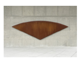
1 Ellsworth Kelly Curve XXIV , 1981

Adjacent to the PACCAR Pavilion and the Gates Amphitheater, the Valley is an evergreen forest most typical of the Northwest's lowland coastal regions, featuring tall conifers such as fir, cedar, and hemlock, and flowering shrubs and trees associated with moist conditions. Living examples of ancient trees once native to Washington, such as the ginkgo and majestic metasequoia (dawn redwood), are also found here. Flowering perennials, ground covers, and ferns define the forest's edges and pathways.