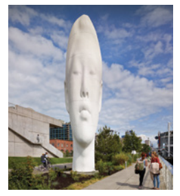
17 Jaume Plensa Echo , 2011

One of the world's foremost sculptors, Plensa modeled Echo on the 9-year-old daughter of a restaurant owner near the artist's studio in Barcelona. The sculpture's title references Echo, the mountain nymph from Greek mythology, who offended the goddess Hera. To punish Echo, Hera deprived the nymph of speech, except for the ability to repeat the last words of another. In this monumental sculpture, over 46 feet tall, Echo listens with her eyes closed or in a state of meditation. She faces Puget Sound in the direction of Mount Olympus, visible from land and water.