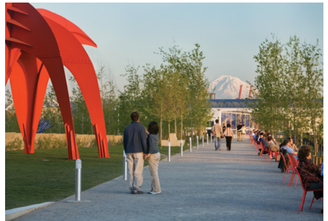
The Eagle , 1971, Alexander Calder.