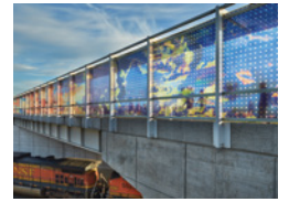
14 Teresita Fernández Seattle Cloud Cover , 2004-2006

Stinger recalls an ancient structure, inviting the viewer to cross a threshold to its interior. Composed of cross sections of tetrahedral and octahedral shapes and resting on a point, it appears to hover above the ground. Originally called "One Gate," Smith ultimately titled Stinger after the cocktail—sweet but slyly intoxicating. In creating Wandering Rocks , Smith, who began his career as an architect, was inspired by molecular and crystalline forms and compelled by a belief in archetypal symbolism. The sculpture's five-part structure pays homage to the Ryoan-ji Zen garden in Kyoto, Japan.