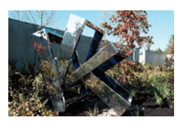
6 Beverly Pepper Perre's Ventaglio III , 1967

Here Nevelson translates her collage approach from wood, a material she favored, to metal, a material she incorporated later in her career. This work features two totemic elements extending to the sky and accented by curved metal. Though three-dimensional, Sky Landscape I reflects Nevelson's devotion to relief sculpture and to the drama available in a shallow field.