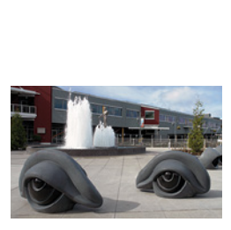
15 Louise Bourgeois Eye Benches I, II and III , 1996-1997

At the Shore, plantings were designed to support habitat for salmon recovery as well as to enhance public access and generate interest in the Puget Sound's distinct shoreline ecosystem. The naturally developing tidal garden features kelp, algae, and other intertidal-zone plants that are revealed and concealed with the changing tides.