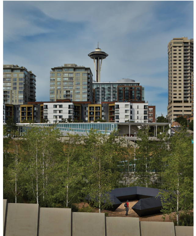
View of Tony Smith's Stinger through the Henry and William Ketcham Families Grove.

SAM proudly supports a healthy and sustainable green space through incorporation of native plants in the park, monthly beach cleanups by volunteers, reduction of chemicals and pesticides in our landscaping, and efficient irrigation with a time- and weather-based watering system. We make it easy for visitors and staff members to recycle waste, to compost food and plant material, and to use public transit, carpools, or bicycles to get to the park.