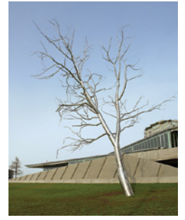
21 Roxy Paine Split , 2003

The Neukom Vivarium is a hybrid work of sculpture, architecture, environmental education, and horticulture. This 60-foot-long nurse log, with its ongoing cycles of decay and renewal, represents the complex processes of a natural ecosystem. Visitors observe life forms within the log using microscopes and magnifying glasses supplied in a cabinet designed by the artist. Illustrations of potential log inhabitants—bacteria, fungi, lichen, plants, and insects—decorate blue and white tiles that function as a field guide.