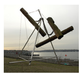
9 Mark di Suvero Bunyon's Chess , 1965

This meadow landscape, with expanses of grasses and wildflowers, meets the sidewalks to achieve a "fenceless" park, providing flexible sites for sculpture.