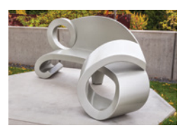
8 Ginny Ruffner Mary's Invitation: A Place to Regard Beauty , 2014

One of the first sculptors of her generation to be captivated by industrial materials, Pepper achieved a cool objectivity in Perre's Ventaglio III , with its sleek, manufactured appearance. Light heightens the optical effect of the sculpture, its surface reflecting the surrounding environment. Persephone Unbound , which alludes to the mythic queen of the underworld who was bound to that subterranean world for one-third of each year, evokes a sense of timelessness and gravity, freedom and eternity.