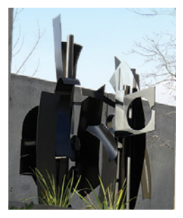
5 Louise Nevelson Sky Landscape I , 1976-1983

For Serra, space is a substance as tangible as sculpture. The towering, curved-steel forms were achieved with computer imaging and a machine that once made nuclear submarines. Wake is composed of five identical modules, each with paired S-shapes—gently curving serpentine of convex and concave sections suggesting tidal waves or profiles of battleships.