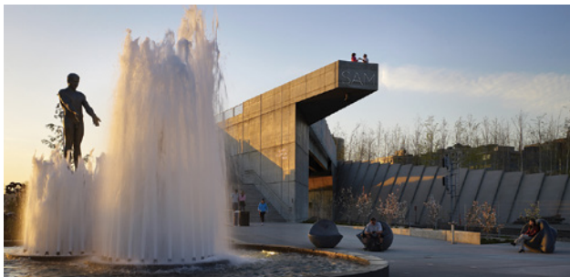
Father and Son, 2004-2006, Louis Bourgeois.

The Olympic Sculpture Park was made possible by a public and private partnership that began with a collaboration between the Seattle Art Museum and The Trust for Public Land. With the engagement of these partners and many generous private and public contributions, the park has transformed our waterfront and become a vibrant gathering space for the city.