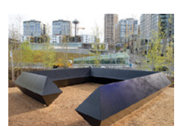
12 Tony Smith Stinger , 1967-1968/1999

The Grove is a forest of native aspen that defines the park's transition from city to shore. Although most closely associated with the dry landscape east of the Cascade Mountains, native aspen are also found in dry coastal sites in the Puget Sound region. The Grove, with its understory of native currant and iris, dramatically reflects the changing seasons, in contrast to the continually green Valley.