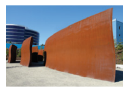
4 Richard Serra Wake , 2004

Rickey, one of the pioneers who brought motion to abstract sculpture, builds on the innovations of American peers Alexander Calder and David Smith. Mixing subtle lyricism with industrial materials, his Two Plane Vertical Horizontal Variation III is a mature example of the artist's kinetic sculpture.