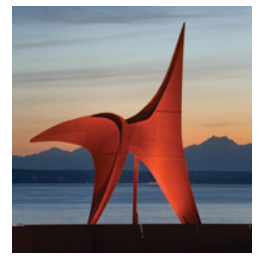
10 Alexander Calder The Eagle , 1971

The crisscrossing steel beams of Di Suvero's Bunyon's Chess —broad brushstrokes drawn in space—formed a new vocabulary in sculpture when this piece was made. Created specifically for outdoor presentation in Seattle, the artwork makes wood a prominent element, a counterpoint to its structure of stainless steel.