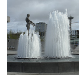
16 Louise Bourgeois Father and Son , 2004-2006

Bourgeois' enigmatic Eye Benches are both giant all-seeing eyes and comfortable outdoor seating. The three sets of two benches are distinguished from one another by variations in scale, form, and detailing. Louise Bourgeois created Father and Son specifically for the Olympic Sculpture Park. As the fountain's water rises and falls, father and son, each in turn, are engulfed in water and separated. It's an impossible and poignant situation, as the two face each other with arms outstretched, striving to overcome the divide.